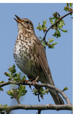
Lt: Songthrush Rt: Bullfinch