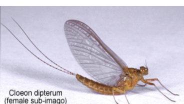
Cloeon dipterum (female sub-imago)