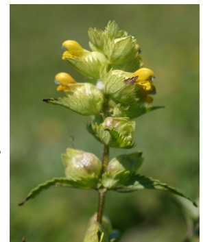
Above: Yellow Rattle Below: Orange-tip Butterfly

Yellow Rattle . When the seeds of this plant ripen, they rattle inside